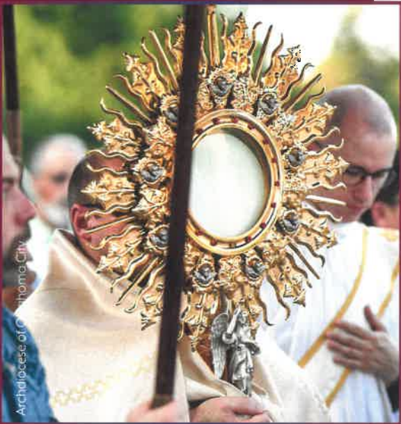
Archdiocese of Oklahoma City

“I AM THE GOOD SHEPHERD WHO LAYS DOWN HIS LIFE FOR THE SHEEP.” ~JOHN 10:11