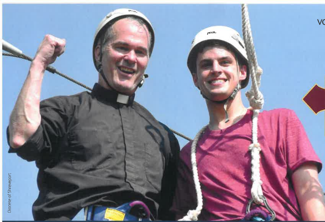
Diocese of Shreveport

“I AM THE GOOD SHEPHERD WHO LAYS DOWN HIS LIFE FOR THE SHEEP.” ~JOHN 10:11